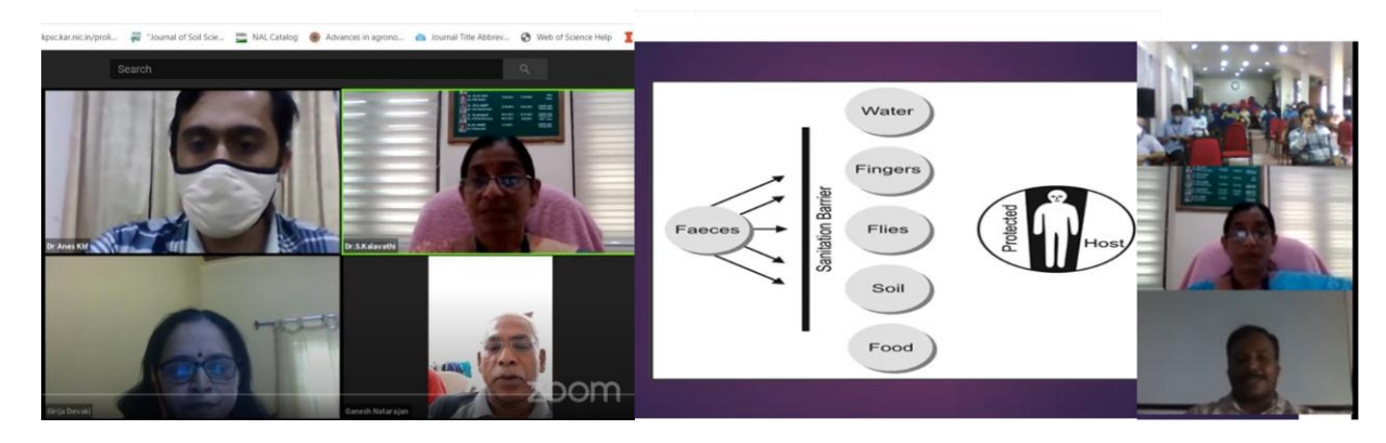
webinar on aerobic composting