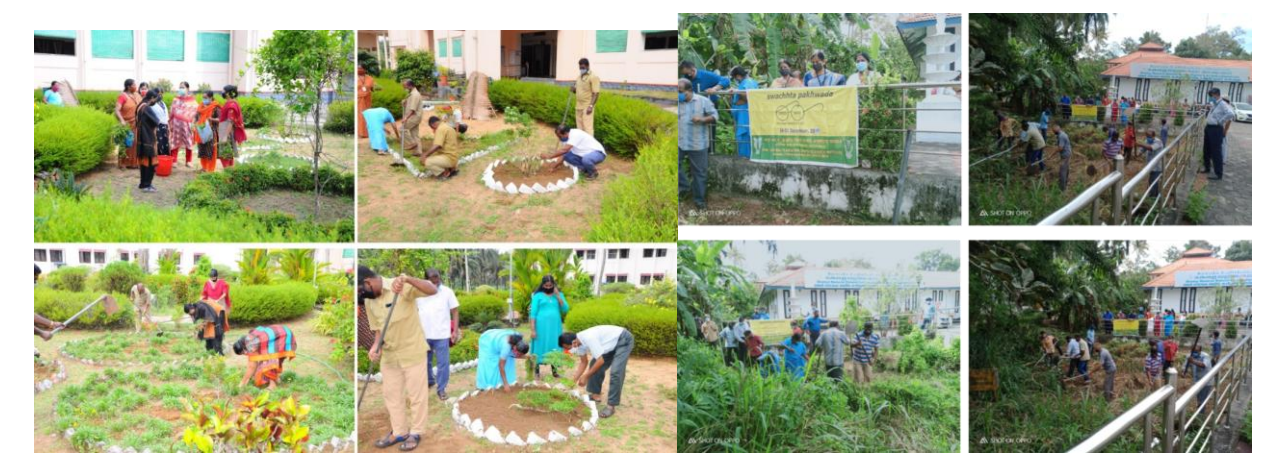
Cleaning of campus garden